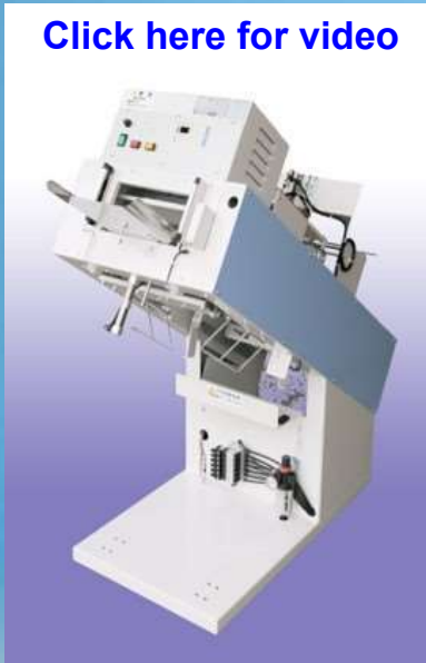
YBF-001 (440 Packs / Hour)